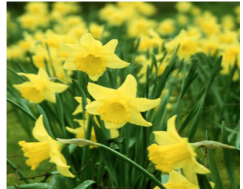
*'Daffodils' by William Wordsworth

everyone and I hope you enjoy this special time with family and friends.